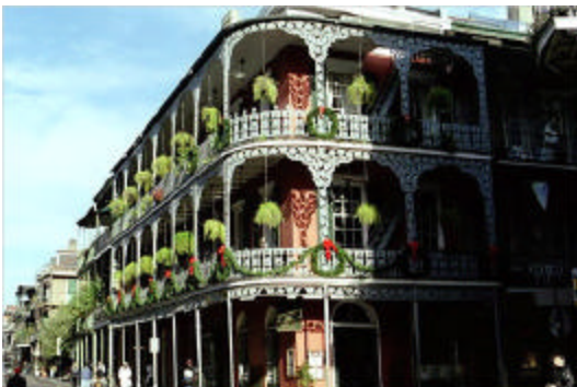
The French Quarter

12:00 - 7:00 PM 2005 Nokia Sugar Bowl Fan Fest in the French Quarter, Decatur Street (Between Jax Brewery and Hard Rock Café) 4:00 PM Pep Rally at the Nokia Unwired Stage at the Nokia Fan Fest