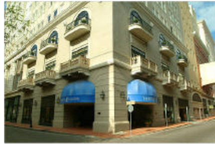
Outside of Iberville Suites