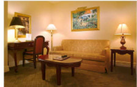
Living room of Iberville Suites